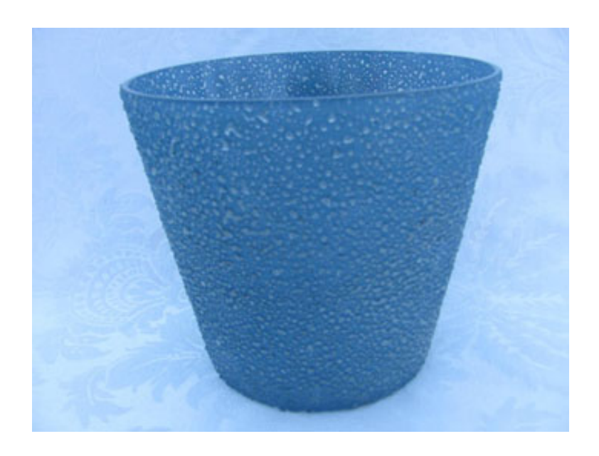
Lot 296 - MacEachron auction