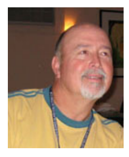
By Tom Jiamachello

Just like the mix of weather outside my window is my column for you all this issue. Here we are in late April with my daffodils blooming as the snow, yes, snow comes down! Wacky weather indeed!