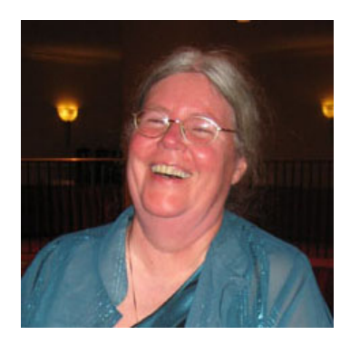
By Sue Cotter

Spring is quickly approaching, which isn't very different from the winter we have been having on Long Island.